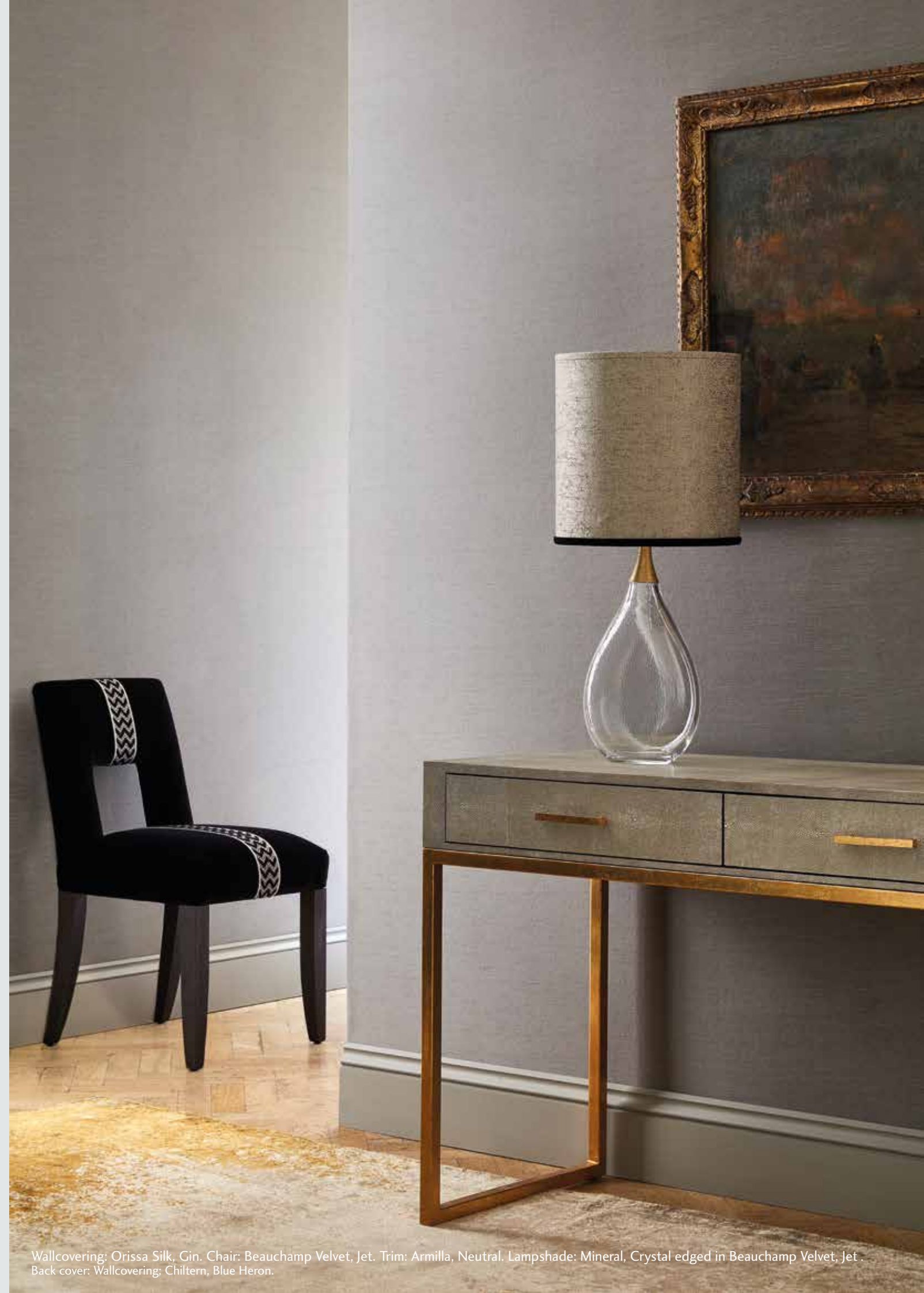
Wallcovering: Orissa Silk, Gin. Chair: Beauchamp Velvet, Jet. Trim: Armilla, Neutral. Lampshade: Mineral, Crystal edged in Beauchamp Velvet, Jet. Back cover: Wallcovering: Chiltern, Blue Heron.

James Hare have launched their first Stocked Silk Wallcoverings collection. Sourced from their extensive range of silk plains, this collection has a 3 metre minimum order and is an exiting addition to their interior service, especially as silk wallcoverings are a strong emerging trend.