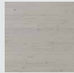
Orissa Silk Ghost 31446WC/228