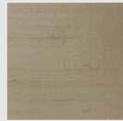
Orissa Silk Seashell 31446WC/07