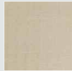
Vienne Silk White Sand 31458WC/12