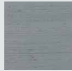
Orissa Silk Cambridge 31446WC/245