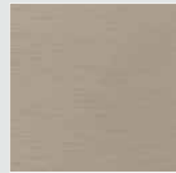
Astor Scallop 31554WC/07