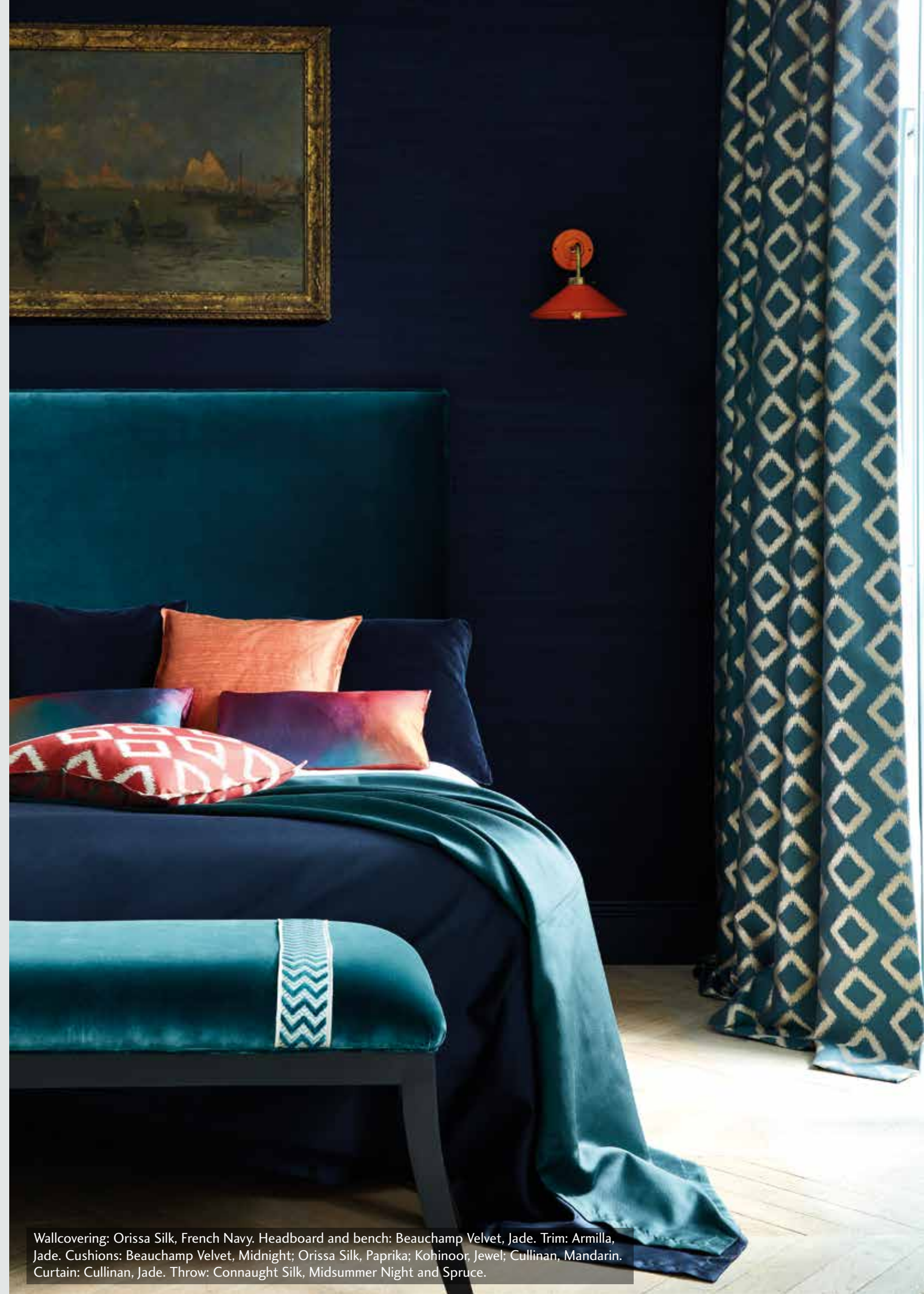
Wallcovering: Orissa Silk, French Navy. Headboard and bench: Beauchamp Velvet, Jade. Trim: Armilla, Jade. Cushions: Beauchamp Velvet, Midnight; Orissa Silk, Paprika; Kohinoor, Jewel; Cullinan, Mandarin. Curtain: Cullinan, Jade. Throw: Connaught Silk, Midsummer Night and Spruce.