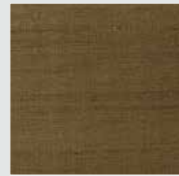
Vienne Silk Bronze 31458WC/09