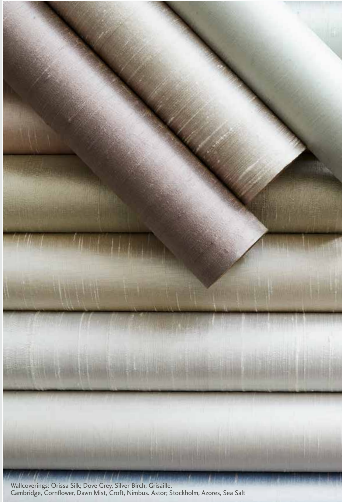
Wallcoverings: Orissa Silk; Dove Grey, Silver Birch, Grisaille, Cambridge, Cornflower, Dawn Mist, Croft, Nimbus. Astor; Stockholm, Azores, Sea Salt