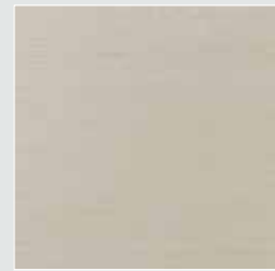
Vienne Silk Chalk 31458WC/01