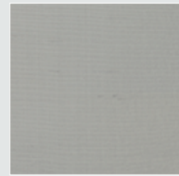
Regal Silk Frost 38000WC/131