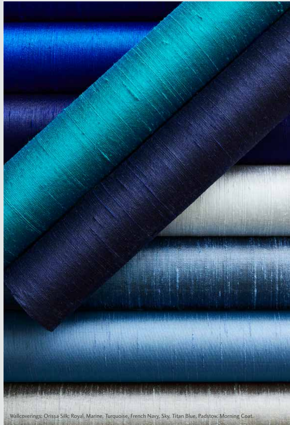
Wallcoverings: Orissa Silk; Royal, Marine, Turquoise, French Navy, Sky, Titan Blue, Padstow, Morning Coat.