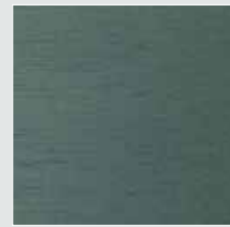
Astor Shale Green 31554WC/28

James Hare have launched their first Stocked Silk Wallcoverings collection. Sourced from their extensive range of silk plains, this collection has a 3 metre minimum order and is an exiting addition to their interior service, especially as silk wallcoverings are a strong emerging trend.