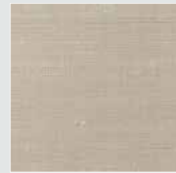
Vienne Silk Grecian Marble 31458WC/39