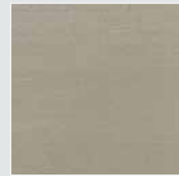
Simla Silk Ash 31463WC/29