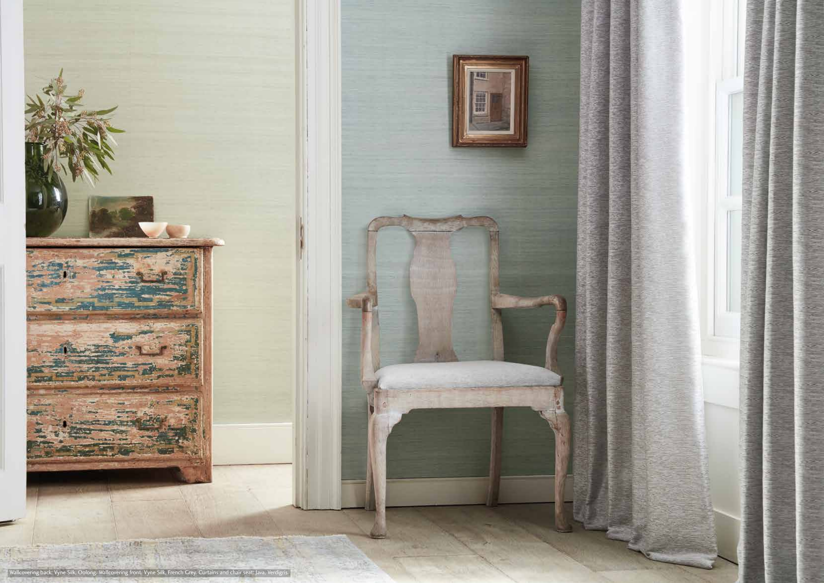
Wallcovering back: Vyne Silk, Oolong. Wallcovering front: Vyne Silk, French Grey. Curtains and chair seat: Java, Verdigris.