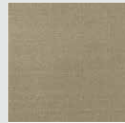
Simla Silk Linen Grey 31463WC/33