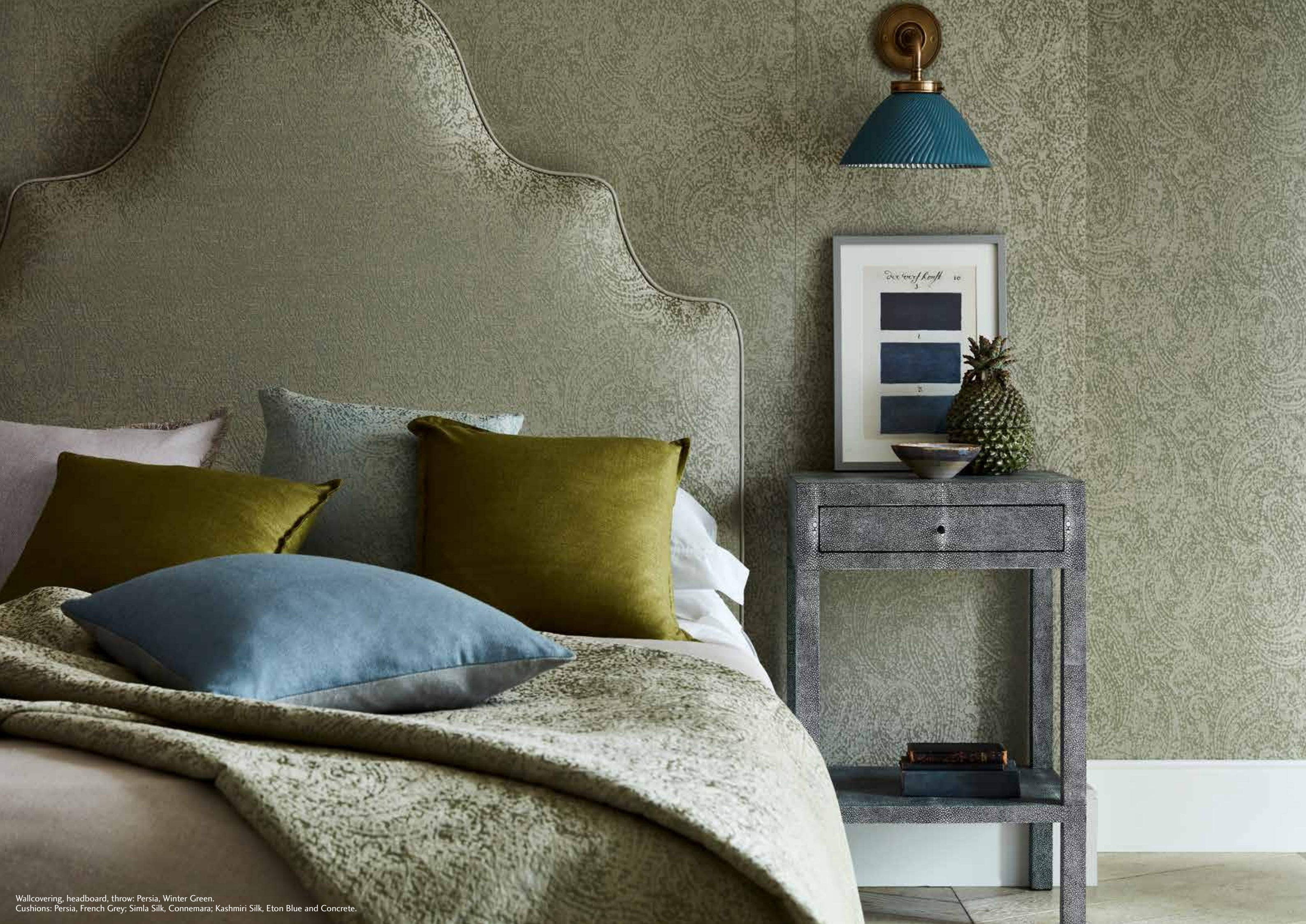
Wallcovering, headboard, throw: Persia, Winter Green. Cushions: Persia, French Grey; Simla Silk, Connemara; Kashmiri Silk, Eton Blue and Concrete.