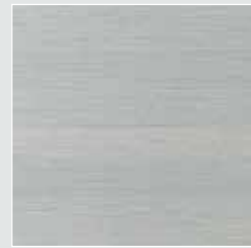
Vienne Silk Mountain Stream 31458WC/52