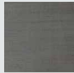
Orissa Silk Morning Coat 31446WC/257