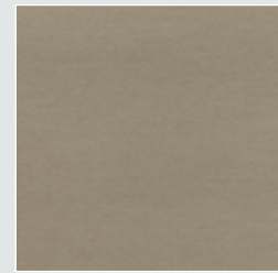
Connaught Silk Mineral 31519WC/05