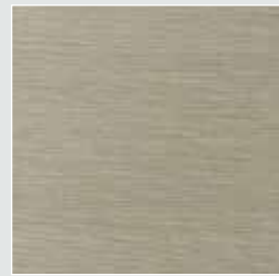
Vienne Silk Antler 31458WC/37