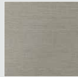
Vienne Silk Dove 31458WC/08