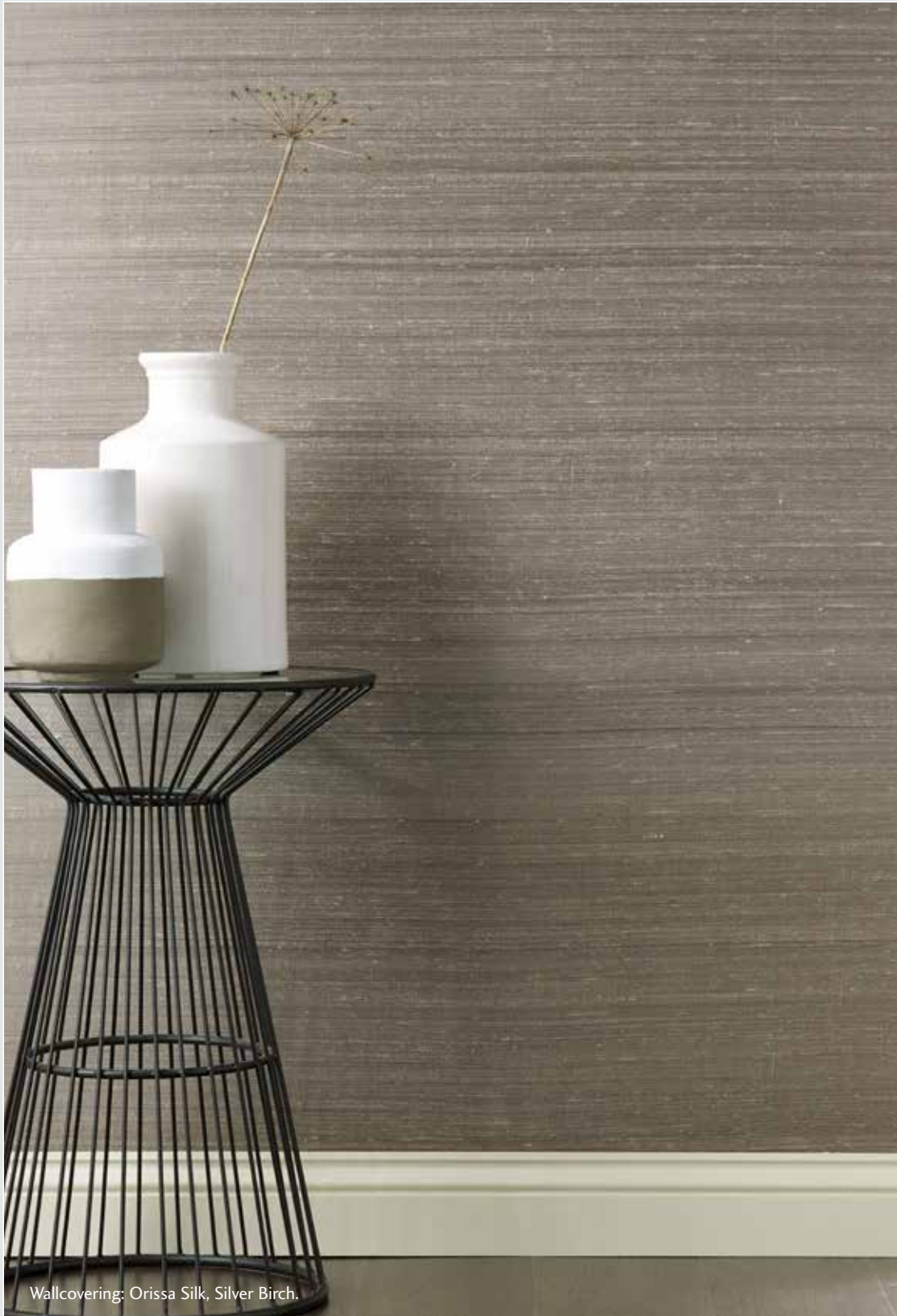
Wallcovering: Orissa Silk, Silver Birch.