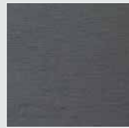
Astor Whale 31554WC/41