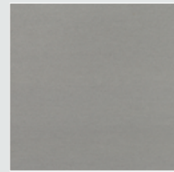
Connaught Silk Antoinette 31519WC/30