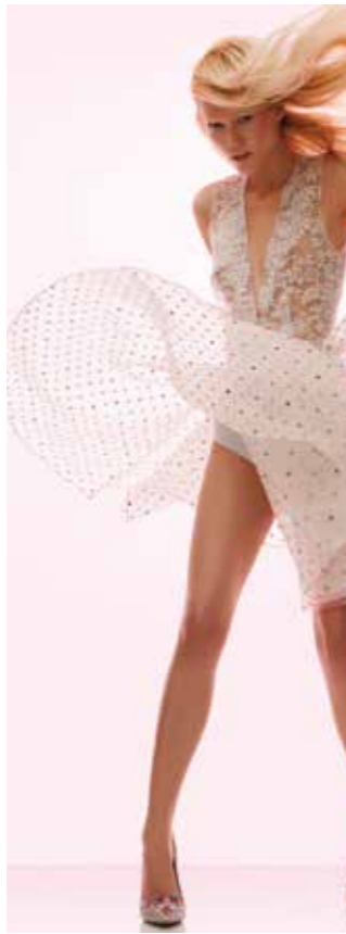
This Page Catwalk images