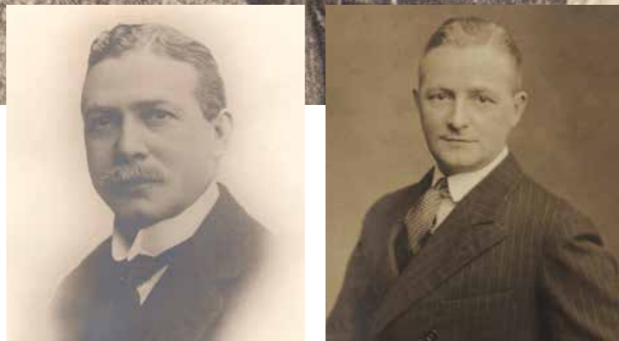
Opposite Page (Right) From humble beginnings on Clare Street