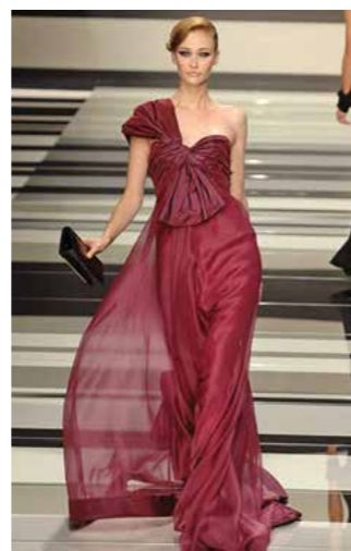
This Page Catwalk images