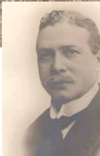
Opposite Page (Right) From humble beginnings on Clare Street