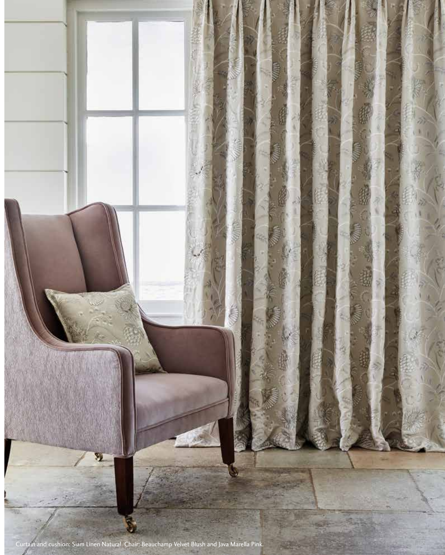
Curtain and cushion: Siam Linen Natural. Chair: Beauchamp Velvet Blush and Java Marella Pink.