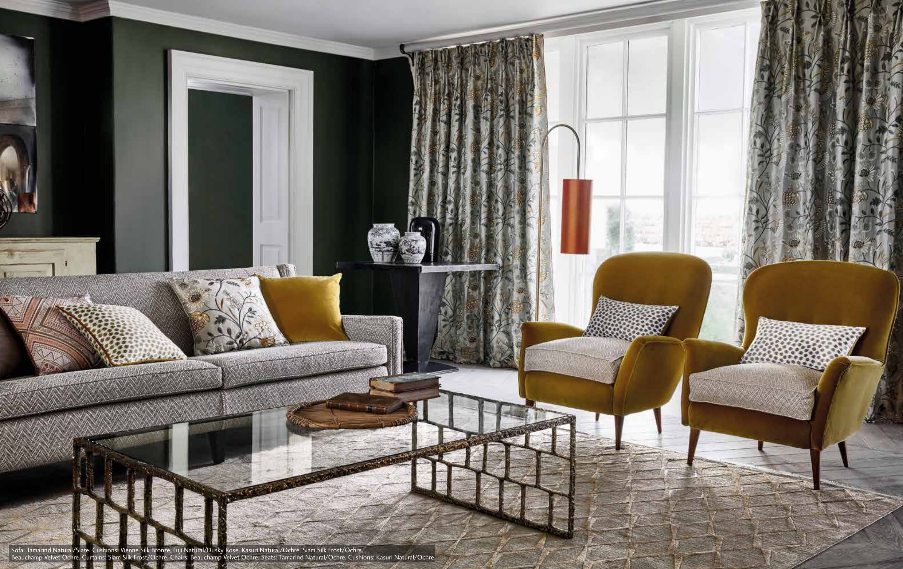
Sofa: Tamarind Natural/Slate. Cushions: Vienne Silk Bronze, Fuji Natural/Dusky Rose, Kasuri Natural/Ochre, Siam Silk Frost/Ochre, Beauchamp Velvet Ochre. Curtains: Siam Silk Frost/Ochre. Chairs: Beauchamp Velvet Ochre. Seats: Tamarind Natural/Ochre. Cushions: Kasuri Natural/Ochre.