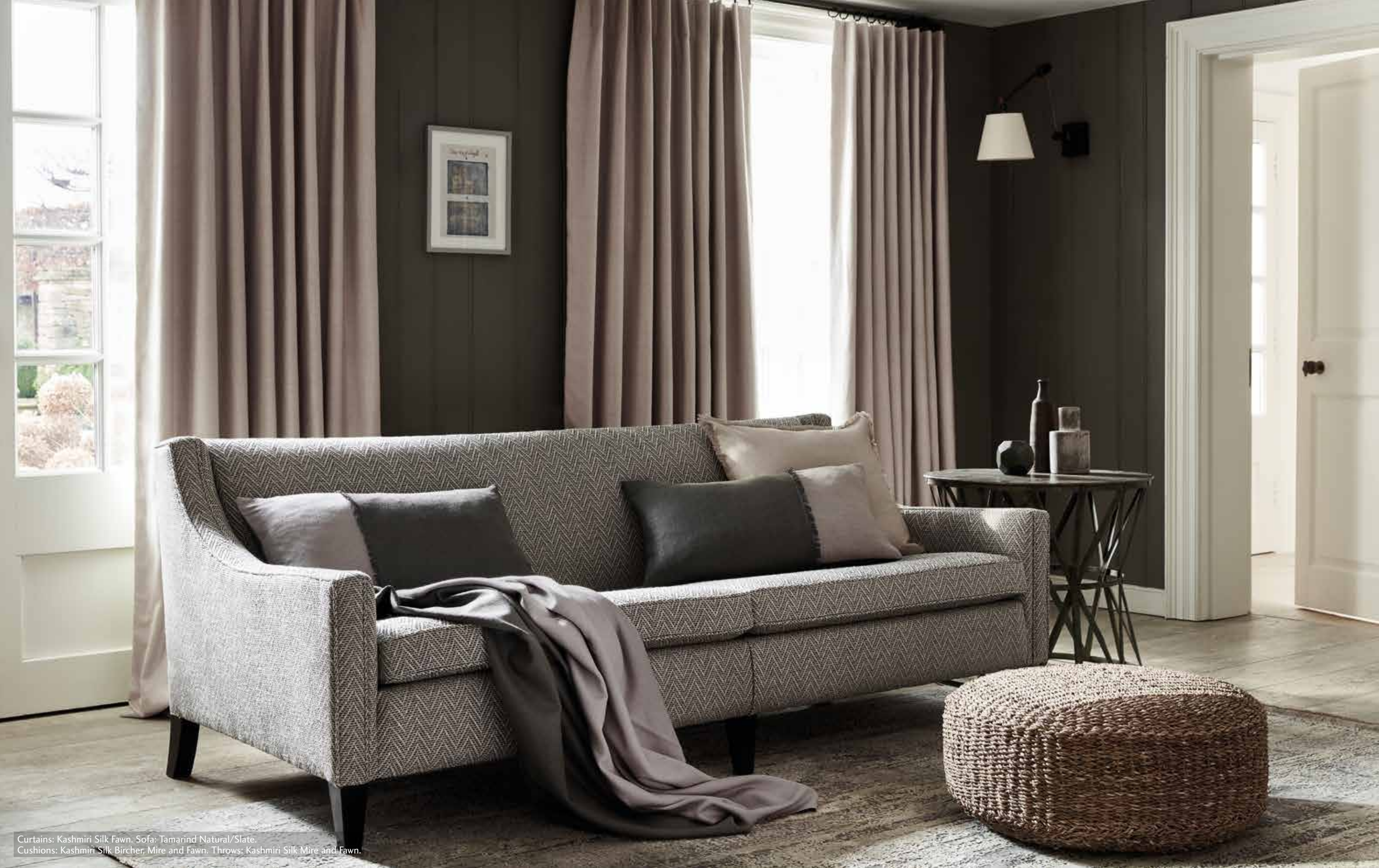
Curtains: Kashmiri Silk Fawn. Sofa: Tamarind Natural/Slate. Cushions: Kashmiri Silk Bircher, Mire and Fawn. Throws: Kashmiri Silk Mire and Fawn.