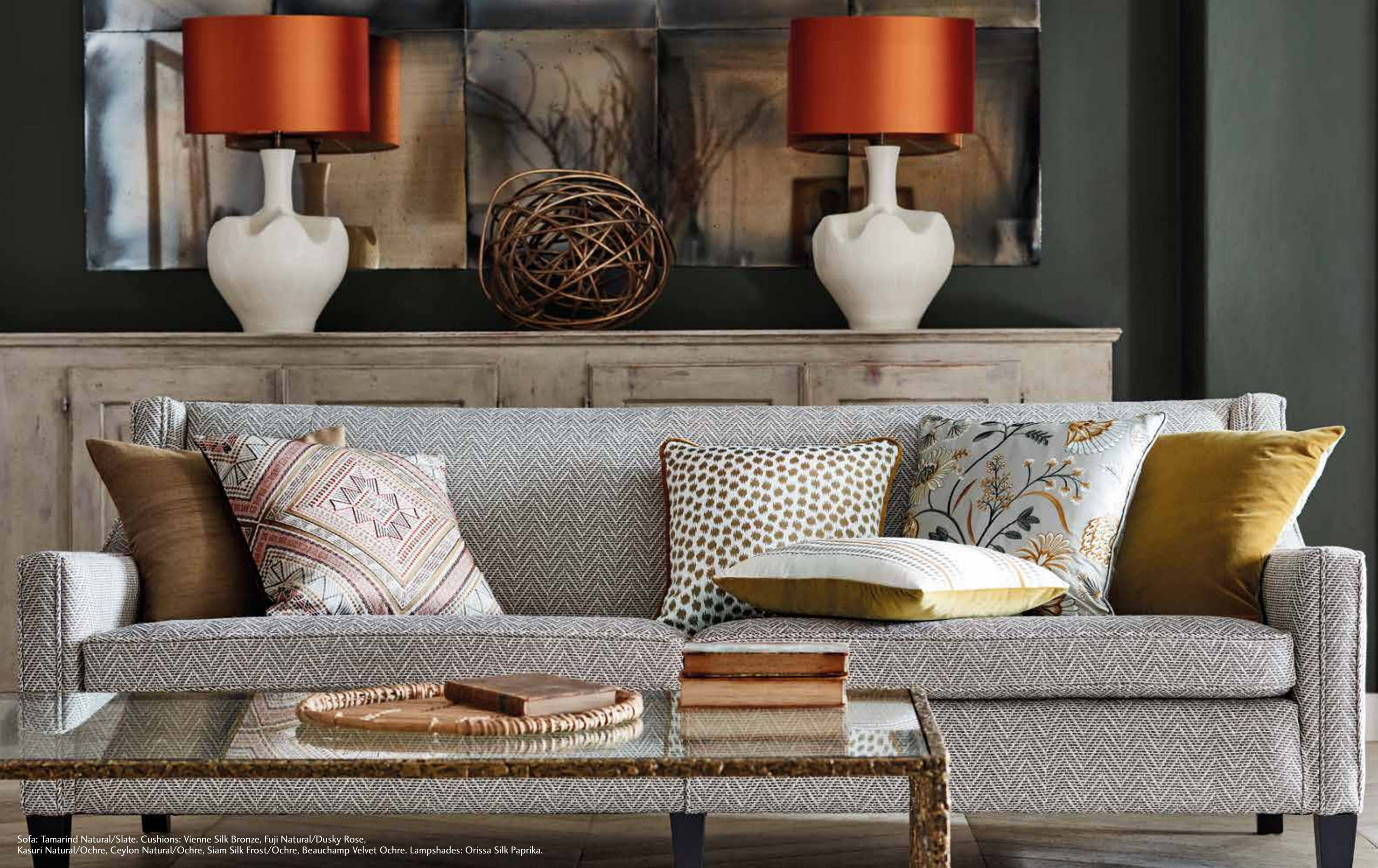
Sofa: Tamarind Natural/Slate. Cushions: Vienne Silk Bronze, Fuji Natural/Dusky Rose, Kasuri Natural/Ochre, Ceylon Natural/Ochre, Siam Silk Frost/Ochre, Beauchamp Velvet Ochre. Lampshades: Orissa Silk Paprika.