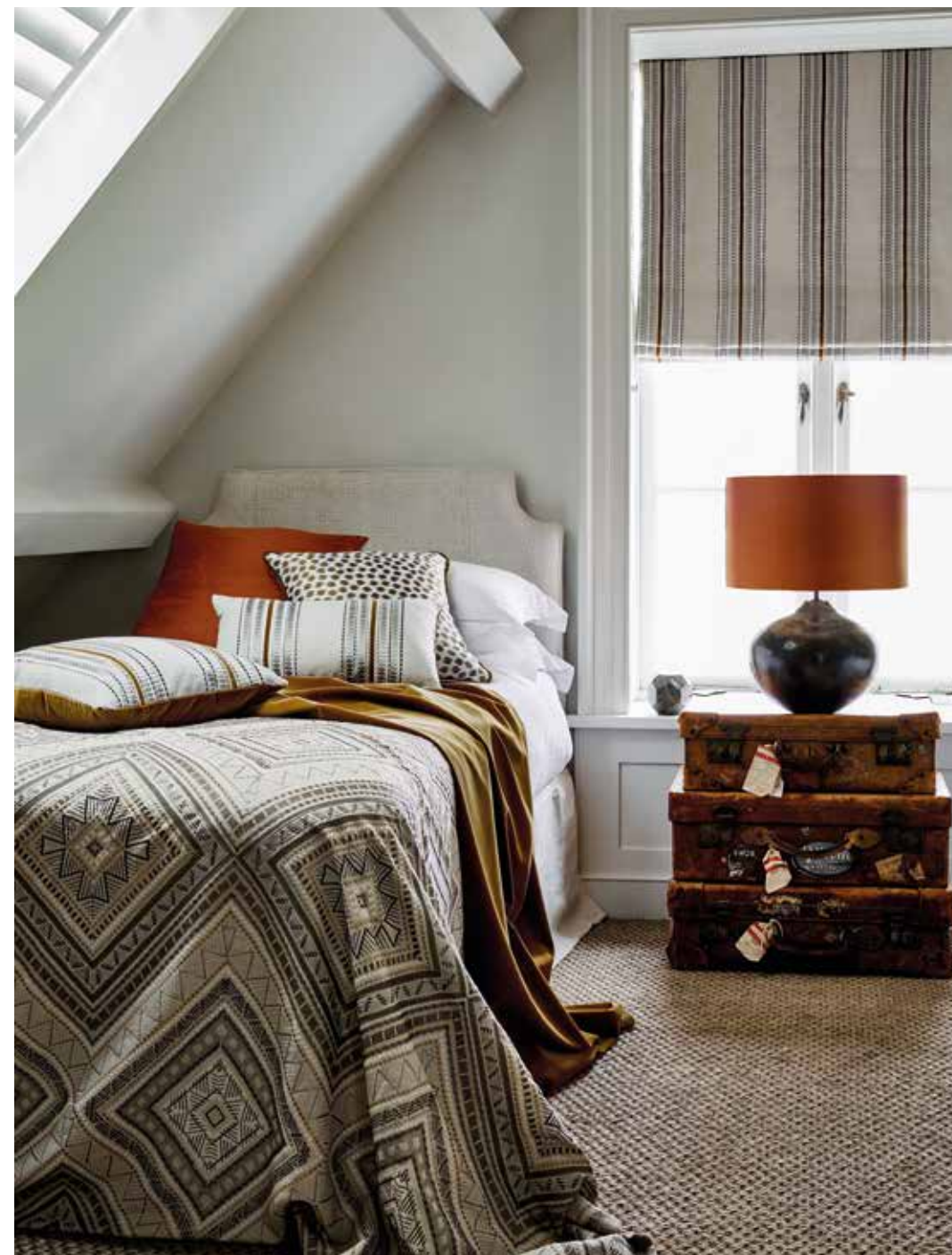
Wallcovering: Orissa Silk Paprika, Bench seat: Beauchamp Velvet Ochre. Cushions: Kasuri Natural/Ochre, Fuji Natural/Dusky Rose. Opposite page. Blind: Ceylon Natural/Ochre. Lampshade: Orissa Silk Paprika. Bed throws: Beauchamp Velvet Ochre and Fuji Natural/Slate. Cushions: Orissa Silk Paprika, Kasuri Natural/Ochre, Ceylon Natural/Ochre.