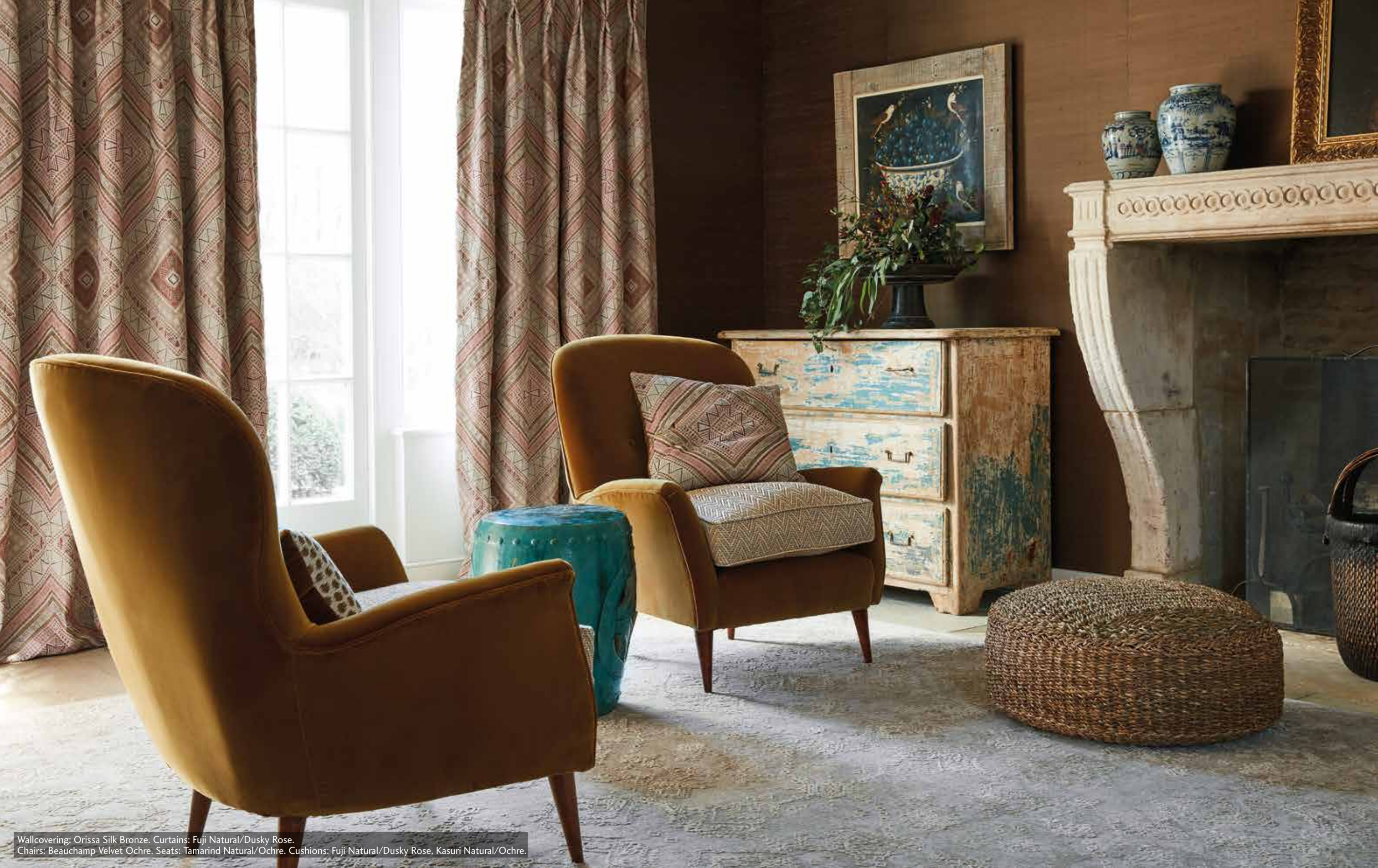
Wallcovering: Orissa Silk Bronze. Curtains: Fuji Natural/Dusky Rose. Chairs: Beauchamp Velvet Ochre. Seats: Tamarind Natural/Ochre. Cushions: Fuji Natural/Dusky Rose, Kasuri Natural/Ochre.