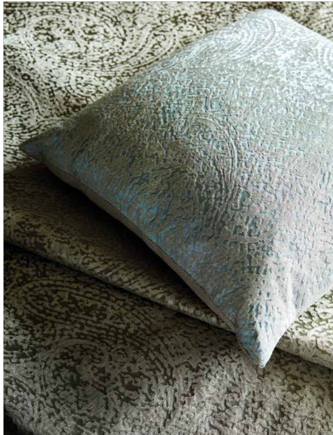
Wallcovering, headboard, throw: Persia Winter Green. Cushions: Persia French Grey, Simla Silk Connemara, Kashmiri Silk Eton Blue and Concrete.