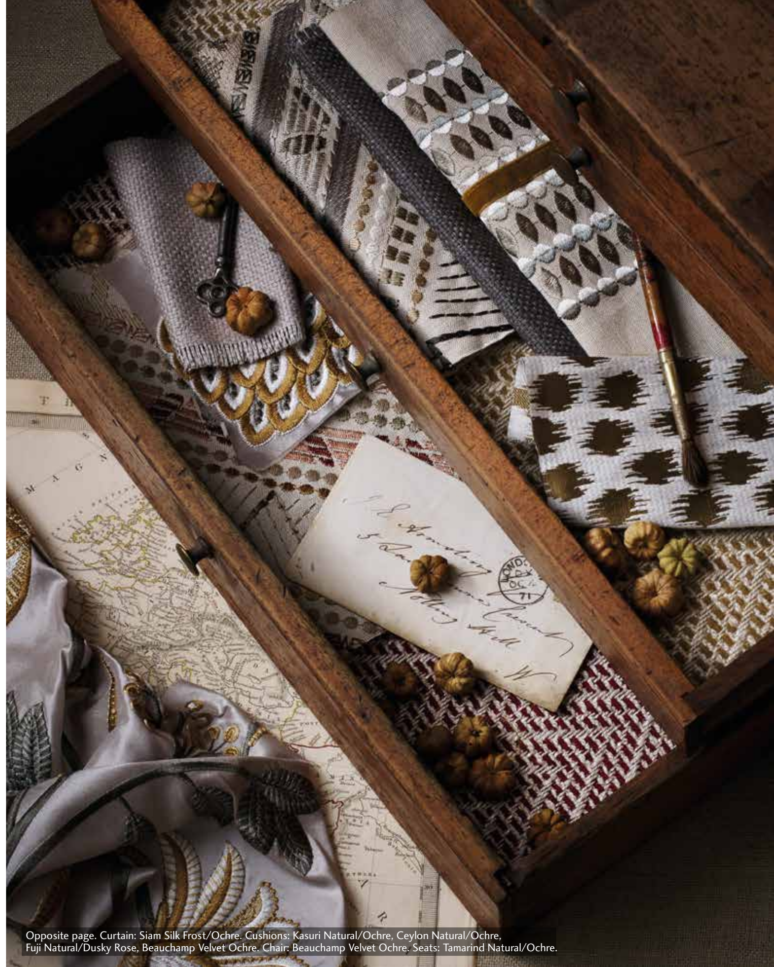
Opposite page. Curtain: Siam Silk Frost/Ochre. Cushions: Kasuri Natural/Ochre, Ceylon Natural/Ochre, Fuji Natural/Dusky Rose, Beauchamp Velvet Ochre. Chair: Beauchamp Velvet Ochre. Seats: Tamarind Natural/Ochre.